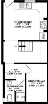
BASEMENT - ROOM HEIGHT = 2.35M