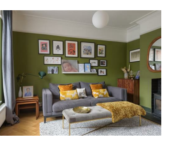
Offers Around £400,000