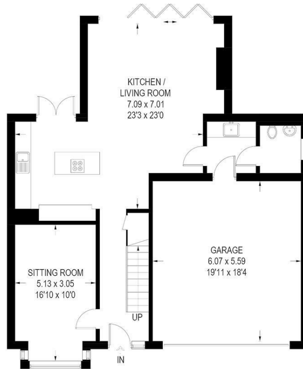
GROUND FLOOR (INCLUDING GARAGE) 111.0 SQ M / 1195 SQ FT

APPROXIMATE GROSS INTERNAL AREA = 204.7 SQ M / 2203 SQ FT (INCLUDING GARAGE)