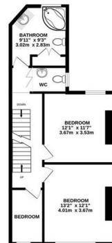
1ST FLOOR CEILING HEIGHT 2.38 M 539 sq.ft. (50.1 sq.m.) approx.