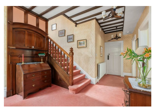
Offers Around £875,000