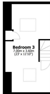
Second Floor Approx. 25.2 sq. metres (270.9 sq. feet)

Total area: approx. 86.9 sq. metres (935.1 sq. feet)