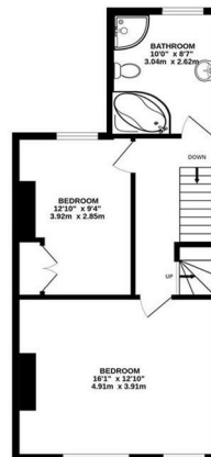
1ST FLOOR 487 sq.ft. (45.3 sq.m.) approx.