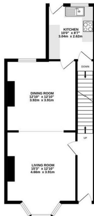
GROUND FLOOR 501 sq.ft. (46.6 sq.m.) approx.