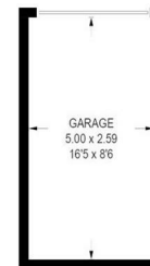
(NOT SHOWN IN ACTUAL LOCATION / ORIENTATION) OUTBUILDING

Illustration for identification purposes only, measurements are approximate, not to scale.