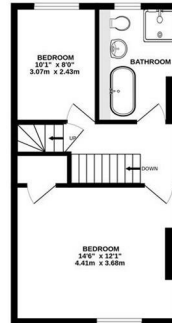
1ST FLOOR 395 sq ft. (36.7 sq m.) approx.