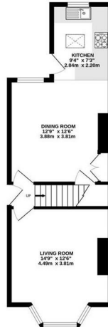
GROUND FLOOR 417 sq ft. (38.7 sq m.) approx.