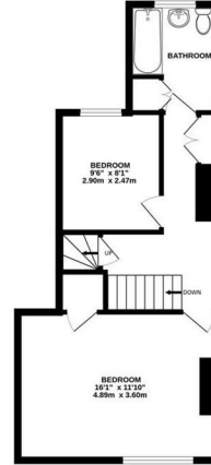
1ST FLOOR 440 sq ft (40.9 sq m.) approx.