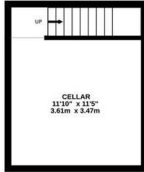
CELLAR 189 sq ft (17.7 sq m.) approx.