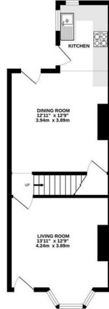
GROUND FLOOR 408 sq ft (37.9 sq m.) approx.