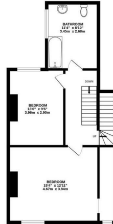
1ST FLOOR 552 sq.ft. (51.2 sq.m.) approx.