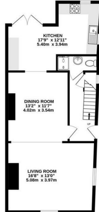
GROUND FLOOR CEILING 2.77 M 605 sq.ft. (56.2 sq.m.) approx.